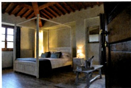
Villa San Michele

Billed as “A stylish bed and breakfast in a Tuscan hamlet,” Villa San Michele delivers amply on that tag line. Stefania and Roger, an Italian-British couple, traveled extensively before settling in Tuscany in 2016 and choosing to renovate a villa in the tiny Vico d'Elsa , almost a fairy-tale location.