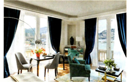
Vista Palazzo Lago di Como